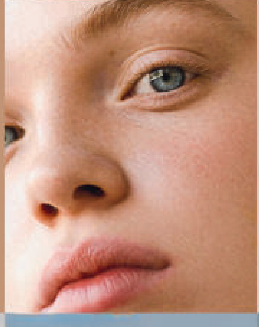
WEVE DEVELOPED A SMART FORMULA THAT MEETS DIVERSE SKIN HEALTH NEEDS