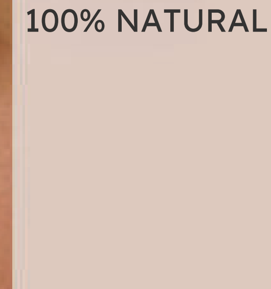
PRESERVATIVES FREE PARABEN FREE CRUELTY-FREE